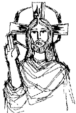
Ascension Thursday